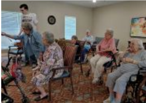
Playing Wii Bowling

A special thank you to the Students of the Occupational therapy Program with Panola for all the fun Activities they hosted.